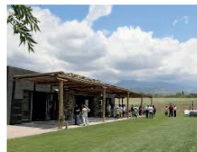
Club de vinos Atamisque