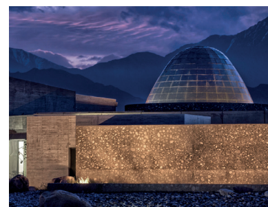
Zuccardi Valle de Uco Finca Piedra Infinta