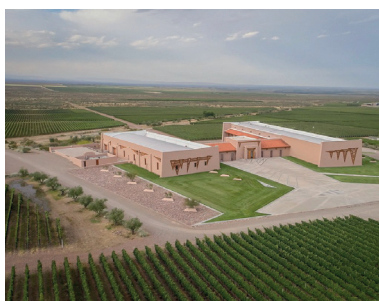
Flecha de Los Andes